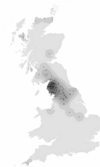
Figure 2 The distribution and density of British towns with "-thwaite, -scale, -slack or -gill" in their names (These are Norwegian derivations)

The time commitment of each party to this VM was probably less than half an hour each, but the result was one that two members could not have produced at all, and one member, the data provider, estimated would have taken him about two weeks to create. The benefit gained by the linguist is clear. The benefit to the data provider was useful dissemination of a publicly funded database and benefit to the processor was acknowledgement in a high quality textbook and extension of a research study which has already generated additional research contacts.