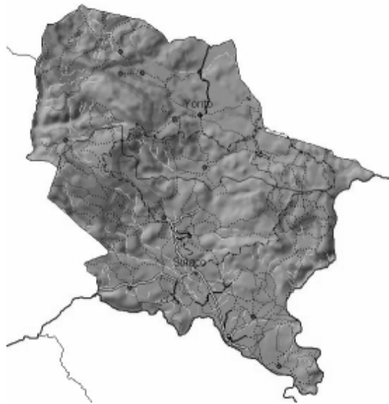
Figure 3 Yorito watershed in Honduras, the site of key case studies, showing relief, drainage and settlements extracted from the national database.